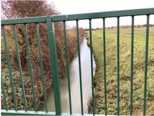
Cricket's Bridge narrow dyke