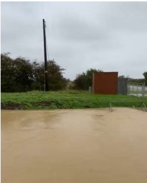
The bridge at the turn to Broxholme from the A1500