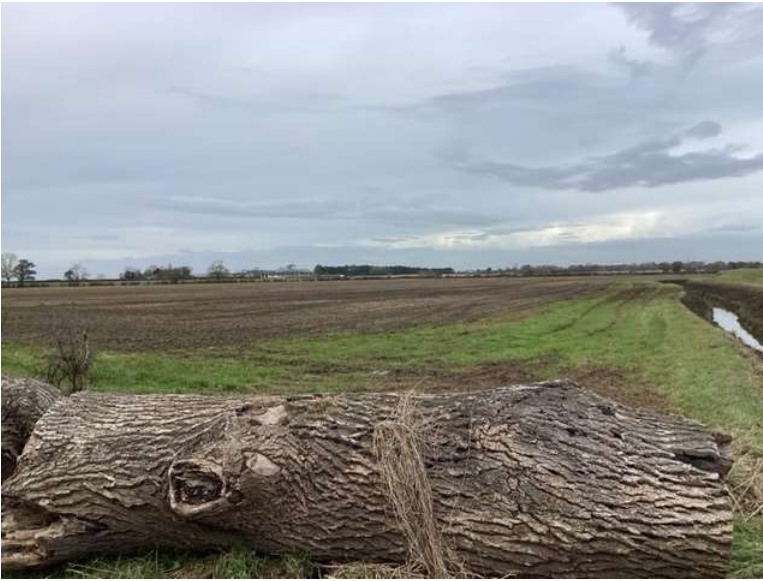
Image 1305 - Viewpoint 20 Broxholme across fields towards B1241. Dyke Image 1291 below.

VIEWPOINT 20 – Broxholme Lane, Saxilby at the Bridge after the flooding on 20 th October 2023 onwards. At this Viewpoint the field(s) allocated for solar panels, fencing, cctv, other hardware, can be clearly seen below left. The dyke that runs through these fields parallel to the Rive Till also shown on these pages. This dyke is very deep and much wider than many, however, it can be seen that the debris has come over the top and is high along the bank, in some cases the water has breached the dyke. Even though the banks are high along these waterways the fields are much lower and the water then finds a level seeping through the river bank onto the agricultural land. This flooding is further complicated when water is released onto the Till Washlands in these areas to protect other properties that are near Rivers and to protect Lincoln City itself from floodwaters.